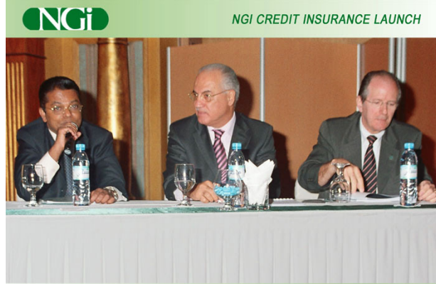
On 1st May 2006 At Le Meridien Hotel, Dubai