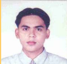
Ariel Medical Underwriting Department