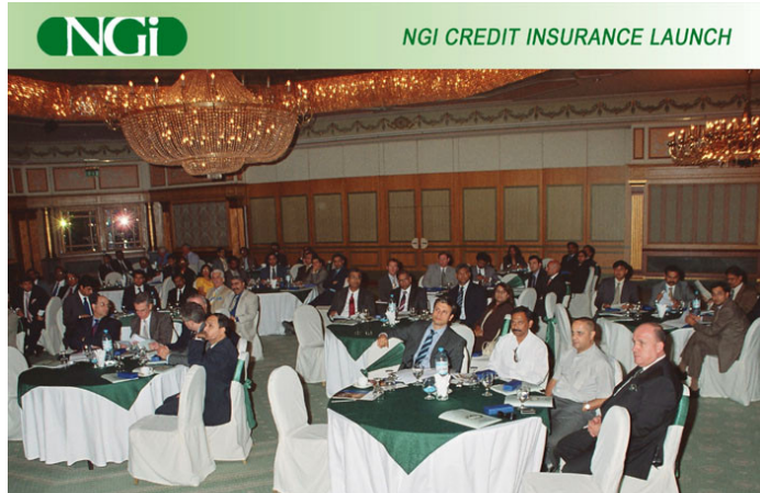
On 1st May 2006 At Le Meridien Hotel, Dubai