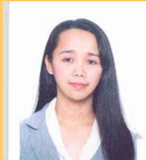
Roann Medical Department