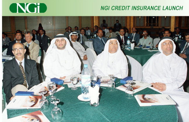
On 2nd May 2006 At Le Meridien Hotel, Dubai